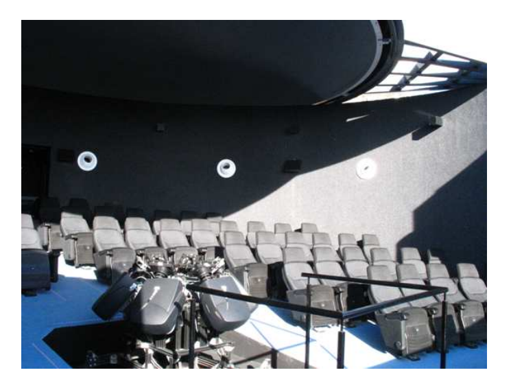
Figure 5: View of the Eye of Montsec with its retractable dome partially opened.