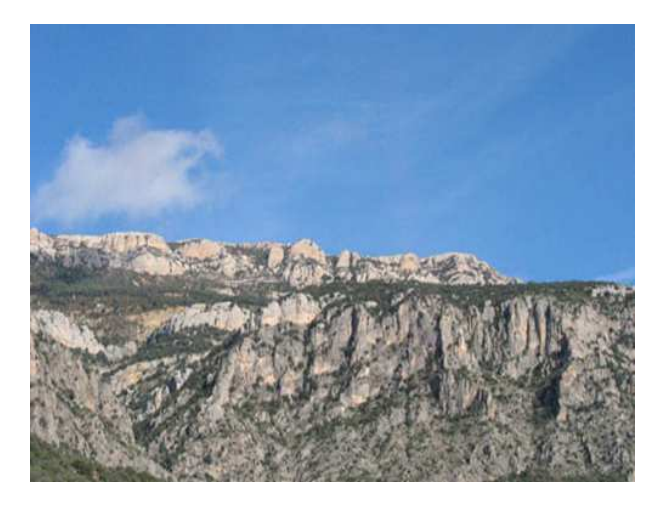
Figure 1: View of Montsec mountain range.

Montsec (PAM) project, this consortium has developed bird-watching routes, trekking routes, and gastronomical initiatives.