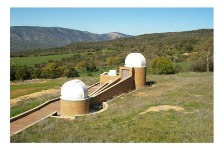
Figure 4: View of the two domes of the telescopes park.

astronomical domes (see Fig. 4) and an area for setting up the COU's portable telescopes. The equipment of the park consists of: