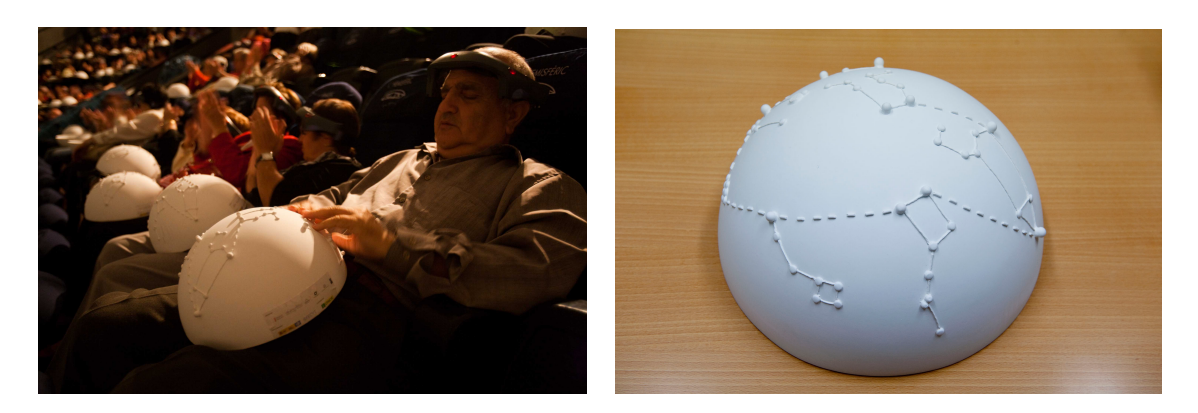
Figure 3: The planetarium show "The sky at your hands" was premiered in October 2009 at the Hemisfèric of the Ciutat de les Arts i les Ciències in Valencia, Spain ( left ). Detail of the hemisphere ( right ).

Figure 2: A book in Braille about astronomy, "Volver a ver las estrellas", was printed from the contents of the "Touch the sky" website.