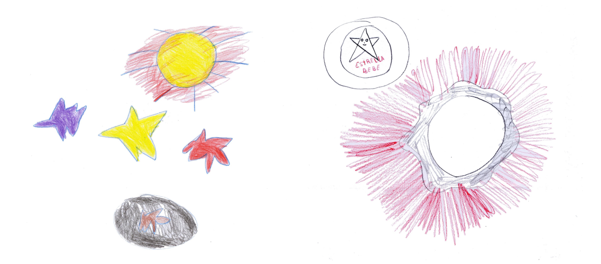
Figure 1: A star cluster ( left ) and a protostar ( right ) as seen by two persons attending the "The life of stars" talk.