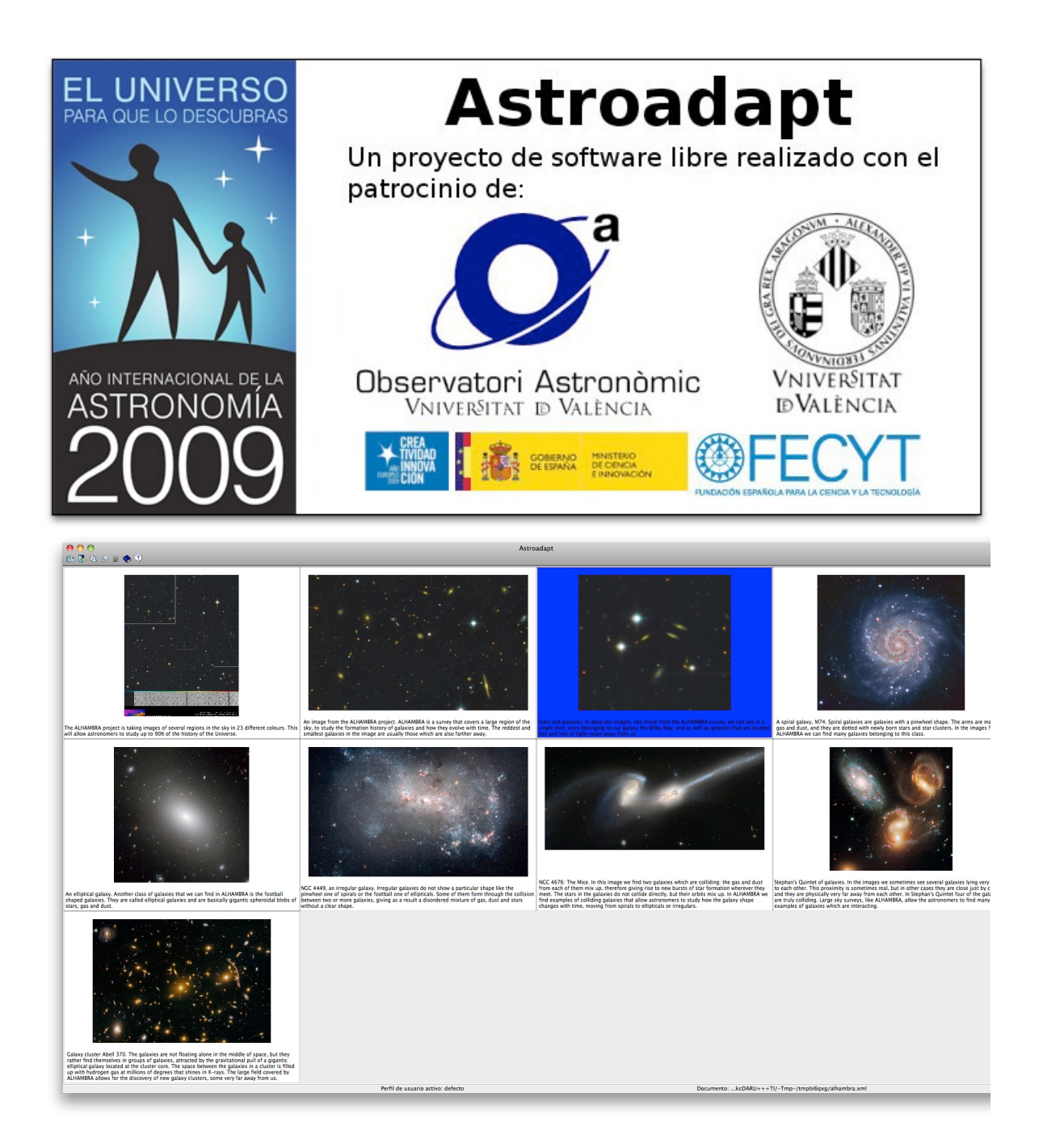
Figure 4: Introduction window of "Astroadapt" ( top ), and an example of the astronomical menu ( bottom ).