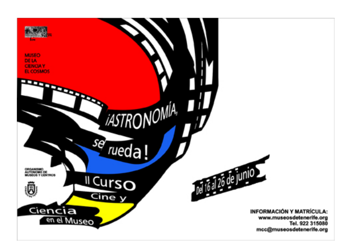
Figure 1: Poster announcing the second course on Film and Science at the Museum, entitled ASTRONOMA, se rueda! (Astronomy and action!) and cover of the book. ( Museo de la Ciencia y el Cosmos )

Scottish astronomer Charles Piazzi Smyth, the first astronomer who observed the Universe from the peaks of Tenerife, in 1856, demonstrating the astronomical advantages of high mountains to look to the skyward. In addition to the large radio antenna (eighteen meters in diameter) crowning the museum roof, with the logo painted inside, which has become a landmark in the area, and a solar telescope and a sundial on the roof of the star-shaped building, also 50% of its permanent exhibition is astronomical. Besides, it has facilities like a full dome digital and analogical planetarium and a tourism attraction called cosmic tourism. But 2009, a year of international engagement with astronomy, also brought about the economic crisis and its savage budget cuts, as we all know. Despite that, our objective was to stimulate interest in the stars. And our strategy, to play with all the colors of a filter wheel. Exploring new resources, contexts and ways of scientific communication, in this case astronomy, and placing risky bets, many of them hand in hand with the IAC.