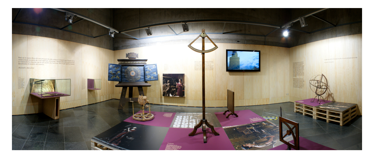
Figure 2: An exhibition of antique astronomical contraptions used in the making of the film "Ágora", based on the life and work of Greek astronomer Hypatia. ( Museo de la Ciencia y el Cosmos )

we published a small catalog. It was an important lure to visit the museum and to learn a little more than astronomy. We estimated about 5 000 visitors. Later, we edited the book with the content of the course ("¡ASTRONOMÍA, se rueda!"). But also related to cinema was a project selected by the Spanish Committee for IYA2009. I mean the planetarium show for children "Jors, Jars, Jurs and the Galigalitos", made available for purchase by museums and planetaria, as some already did: those of La Coruña, Pamplona, Cuenca, Valladolid, and Palma de Mallorca. A project which, fortunately, as others that will be referred to here, was funded by the "Septenio" program of the Canary Islands Government and FECYT (Spanish Foundation for Science and Technology). The puppets of the planetarium program will be part of a spectacular exhibition that will open at the end of this year (Fig. 3).