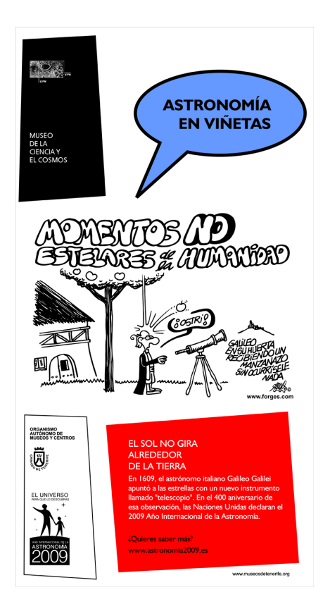
Figure 6: Poster announcement the exhibition "Astronomía en viñetas" (Astronomy in comic strips), one of the projects selected by the Spanish Committee for IYA2009. (Museo de la Ciencia y el Cosmos)