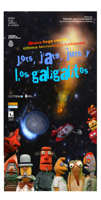
Figure 3: Poster announcement the Planetarium programme for children "Jors, Jars, Jurs y los Galigalitos", one of the projects selected by the Spanish Committee for IYA2009. (Museo de la Ciencia y el Cosmos)

of Pamplona, where two performances took place in March, coinciding with the V Congress of Social Communication of Science, after 6 functions had taken place in Tenerife. The show has been entirely successful in terms of audience, with 2000 people of all ages and groups having seen it. The script has been published and you can access four scenes of the play with astronomical content at YouTube through the Museos de Tenerife web site.