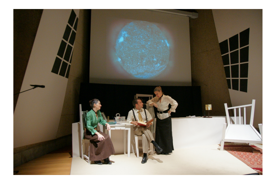
Figure 4: One of the scenes of the multimedia play entitled "The Lost Honour of Henrietta Leavitt", staged in Tenerife and Pamplona, a tribute to the role of women in Astronomy. (Museo de la Ciencia y el Cosmos)