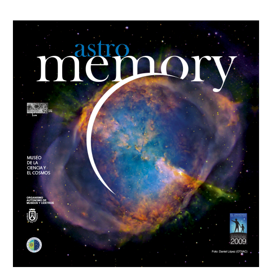
Figure 5: Cover of the "Astromemory" game, made by the Museum and the IAC.