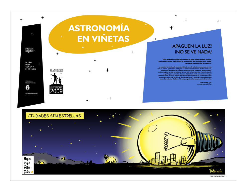
Figure 7: One of the comic strips of the exhibition "Astronomía en viñetas" (Astronomy in comic strips): against light pollution. (Museo de la Ciencia y el Cosmos)