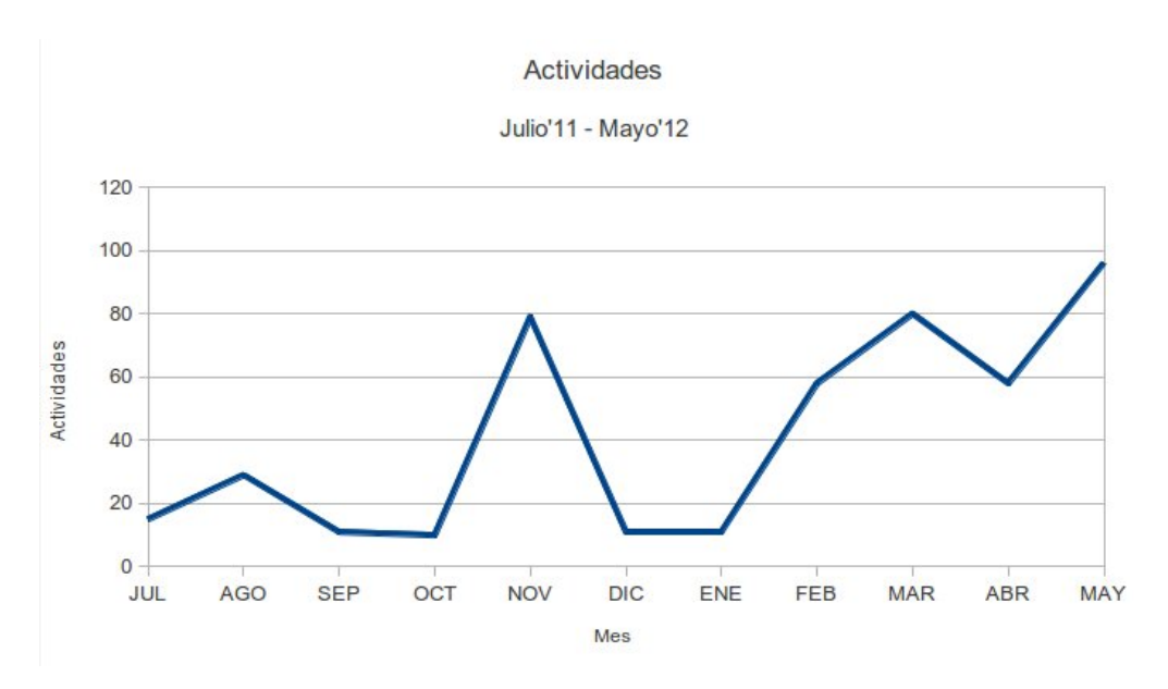
Figure 1: Evolution of the number of activities over time.

The main target of the REDA was continuing the boost of the IYA2009 to do Astronomy outreach with rigor and quality.